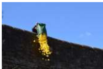
There they go!