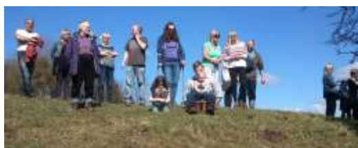
What a glorious day!!!!