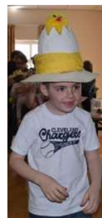
and some handsome bonnets!