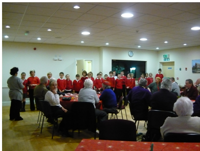
The after dinner entertainment from the choir

The Christmas Fair is being replaced by a ' Nearly New Sale ' on 26 th February and the Sing for Life choir are now coming on Friday April 1 st so for Waterhouses the Christmas season is lasting over four months!