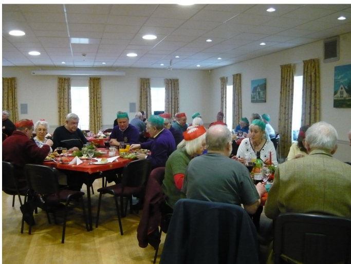
Tucking in to the Christmas Dinner