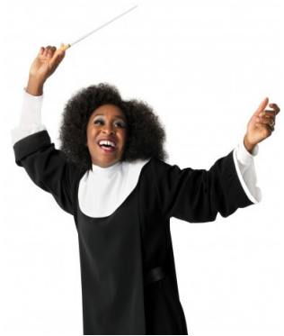
Sister Act musical