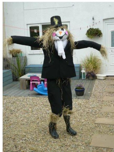
One of the 2011 scarecrows

The date for these events is Saturday 8 th September. More details in the next issue of 'Wanderings'.