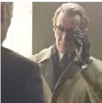
Garry Oldman, the new Smiley in Tinker, Tailor, Soldier, Spy

with a varied program of films each Wednesday night. See the web for the most up to date details. Recently we have enjoyed the latest 'Tinker, Tailor, Soldier, Spy' film and, for the kids, 'Horrid Henry'.