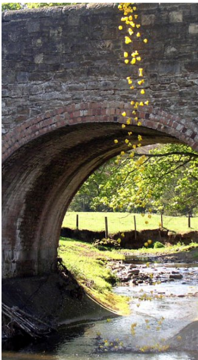
Start of Duck Race 2011

On Sunday 8 th April (Easter Day) there will be the