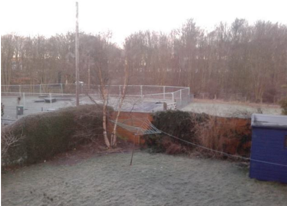
The Empty Playground in February 2015