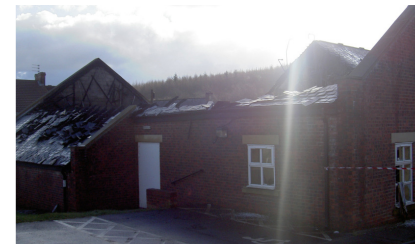
Remember this? The hall in February 2006

It's taken a long time but the work was completed on, would you believe it, Friday 13 th April 2007.